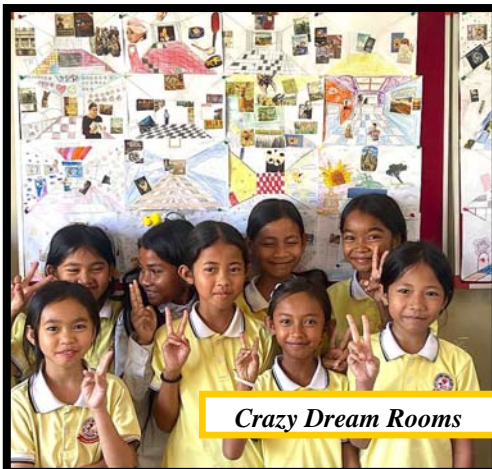
Crazy Dream Rooms

Those born before the 1970's are the last generation to know what it's like to live life without staring excessively at screens. So if anyone can help our youngsters, it's us! That's a sobering responsibility! Here are some things we've tried and found fruitful: when teaching art at our village school or girls' shelter, we play instrumental music to immerse them in sensory input; listening, cutting, pasting, painting, coloring, drawing. For at least one class period per week we play games, dance, learn a new song, do art, read stories or play sports. We