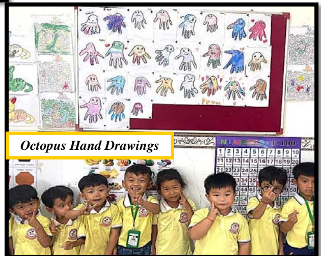
Octopus Hand Drawings