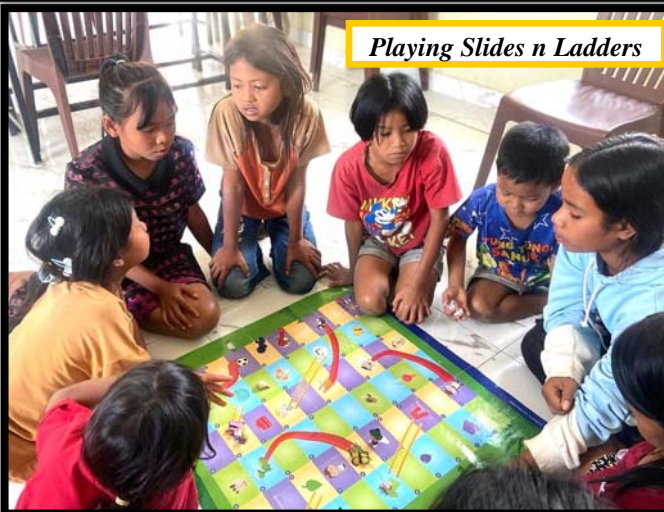
Playing Slides n Ladders

mentor individual kids or small groups in various life skills like caring for chickens, carpentry, home repairs, how to use power tools; how to play guitar, board games, type, sew by hand, follow recipes, cook meals. The more we do, the more we see can be done to enrich the lives and minds of this generations' children. The goal? That they will be free to become all that God created them to be.