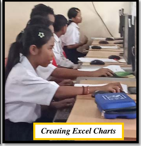
Creating Excel Charts