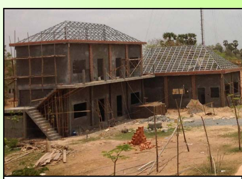
80% finished as of April first!