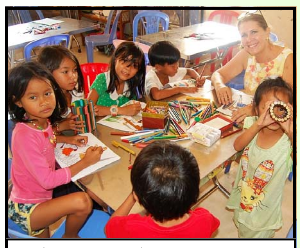
Reducing stress and encouraging creativity

teaching day after day, week after week, until children gain confidence, a love for learning and a will to thrive. Does it achieve long-term results? Yes, indeed! On a recent visit to the protection shelter we had the privilege to meet with 7 young women that we've supported & worked with for over a decade. All are high school graduates and now working towards degrees in law, social work and finance!