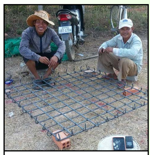
Workers preparing rebar for foundation pillars

As of this moment the buildings are 80% complete and we hope to "cut the ribbon" by June!